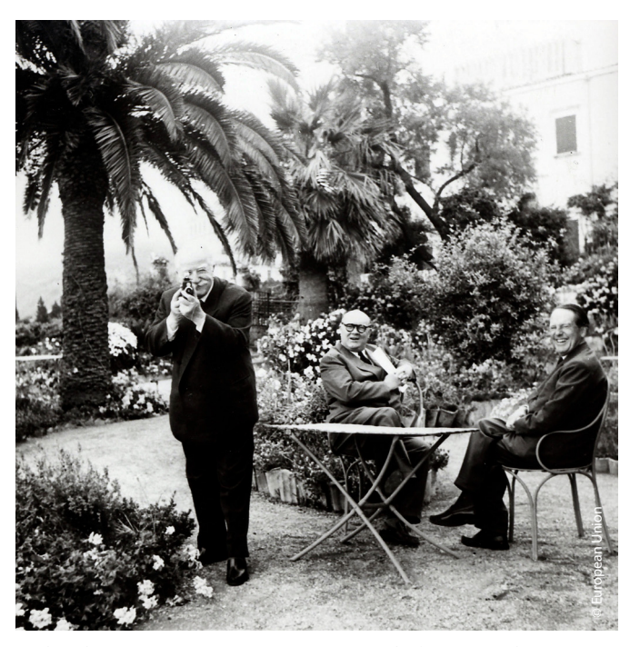
Bech with a cine-camera, enjoying a moment of relaxation at the Messina Conference in 1955.

Benelux countries, including Joseph Bech as the representative of Luxembourg. The memorandum combined French and Dutch plans offering both to undertake new activities in the fields of transport and energy, especially nuclear, and a general Common Market, with focus on the need for a common authority with real powers. On the basis of experience with the Benelux and the Coal and Steel Community, the three Foreign Ministers proposed a plan, that further developed on an idea put forward by Dutch Minister Beyen, which recommended economic cooperation as the way to achieve European unification. This 'Spaak Report', named after Belgian Minister Spaak, Chairman of the Committee that had drafted it, became the basis for the Intergovernmental Conference which drafted the treaties on a common market and atomic energy cooperation, and which were signed in Rome on 25 March 1957.