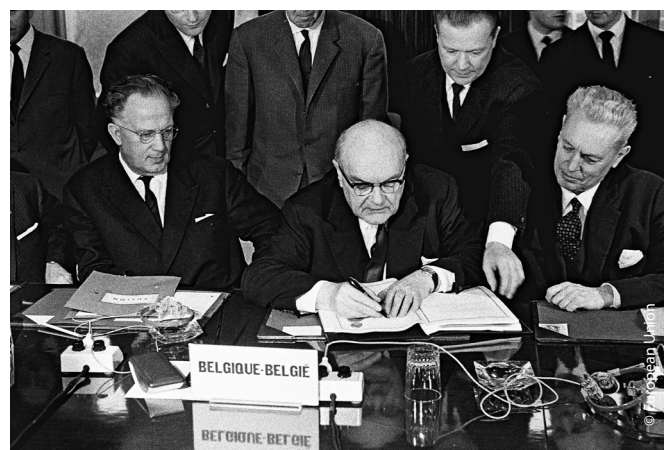
Spaak signing a European treaty on behalf of Belgium in 1965.

Throughout his political life, Spaak always defended the importance of European integration and the independence of the European Commission with great vigour: "The Europe of tomorrow must be a supranational Europe," he stated to rebuff French President de Gaulle's 1962 'Fouchet Plan', attempting to block both the British entry to the European Communities and undermine their supranational foundation. The European unity Spaak envisaged was mostly economic. The Belgian statesman desired political unification but not on the basis of the Common Market countries alone. He was therefore against any further actions until economic integration of Britain into the union had taken place. He retired from politics in 1966 and died in Brussels in 1972.