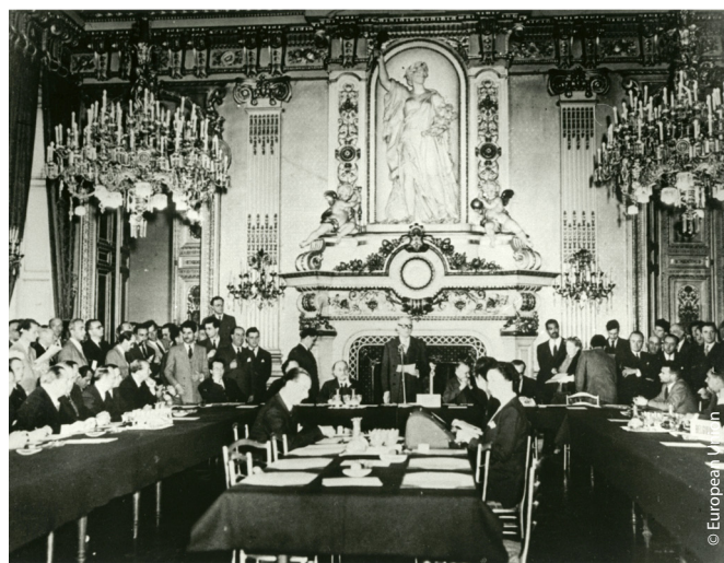
Schuman giving his famous speech on 9 May 1950, the day that is now celebrated as the EU's birthday.

However, his efforts did not stop there. He became a great proponent of further integration through a European Defence Community and in 1958 he became the first President of the predecessor to the current European Parliament. When he left office the Parliament bestowed on him the title of 'Father of Europe'. Because of the significance of his 'Schuman Declaration' on 9 May 1950, this day has been designated as 'Europe Day'. And, in honour of his pioneering work towards a united Europe, the district housing the headquarters of several European Union institutions in Brussels is named after him.