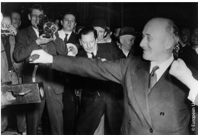
Jean Monnet starts the first production of cast iron under the European Coal and Steel Community.

In 1943, Monnet became a member of the French Committee of National Liberation, the de facto French government in exile in Algiers. It was at this time that he first became explicit about his vision for a union of Europe to regain and retain peace. During a meeting of this committee on 5 August 1943, Monnet declared: "There will be no peace in Europe, if the states are reconstituted on the basis of national sovereignty... The countries of Europe are too small to guarantee their peoples the necessary prosperity and social development. The European states must constitute themselves into a federation..." In 1944 he took charge of the national modernisation and development plan aimed at reviving the French economy and rebuilding the country after the war.