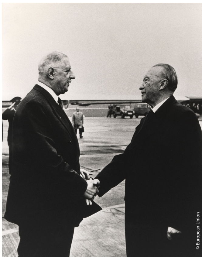
Adenauer shaking hands with French President Charles de Gaulle in 1961.

After the war, Adenauer was reinstated as Mayor of Cologne by the Americans but removed shortly afterwards by the British, when Cologne was transferred into the British zone of occupation. This gave Adenauer the time to devote himself to the setting up of the Christian Democratic Union (CDU) which he hoped would unify Protestant and Catholic Germans in one party. In 1949, he became the first Chancellor of the Federal Republic of Germany (West Germany). Initially, it was thought that Adenauer would be Chancellor for only a short time, as he was already 73 years old by this time. However, despite this belief, Adenauer (nicknamed 'Der Alte', or 'The Elder') went on to hold this position for the next 14 years, making him not only the youngest ever mayor of Cologne, but also the oldest chancellor Germany has ever seen. Under his leadership, West Germany became a stable democracy and achieved a lasting reconciliation with its neighbouring countries. He managed to regain some sovereignty for West Germany, by integrating the country with the emerging Euro-Atlantic community (NATO and the Organisation for European Economic Cooperation).